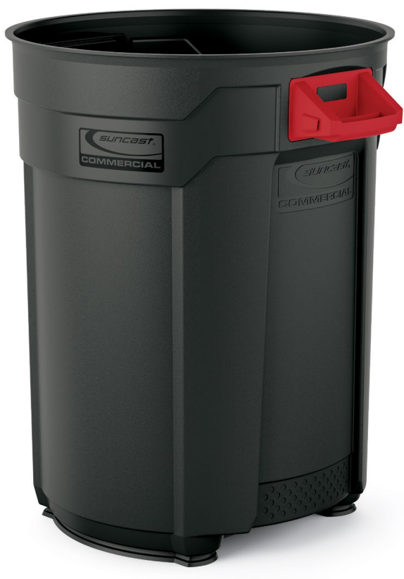
BMTCU55 model shown

Heavy-duty construction to withstand everyday use