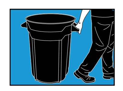
REINFORCED BASE - 76% STRONGER THAN COMPARABLE CANS