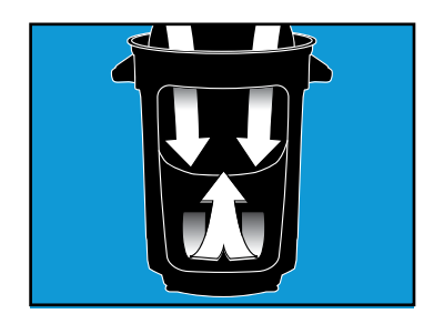
EXTRA-LARGE AIR CHANNELS FOR EASY LINER REMOVAL

Products are subject to change without notice; dimensions and colors may vary from the actual product.