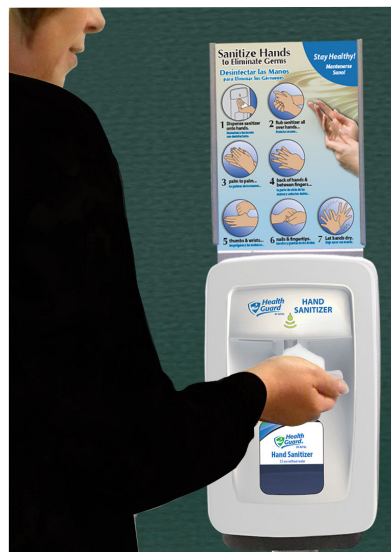
Dispenser shown at standard height