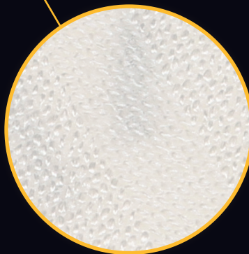
Complex woven texture for commercial use