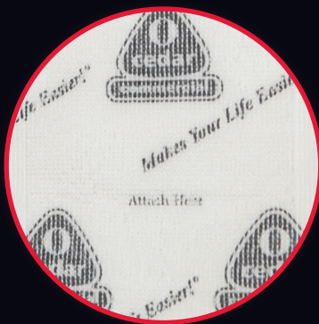
Back of the Pad Design