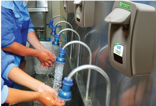
E2 Hand Sanitizer/Cleaners reduce the risk of food borne illnesses

Food facilities that practice good hygiene in every area build a solid reputation for quality. Clean restaurants and grocery stores attract customers and drive repeat business. Health Guard can help you meet FDA Food Code requirements and achieve success!