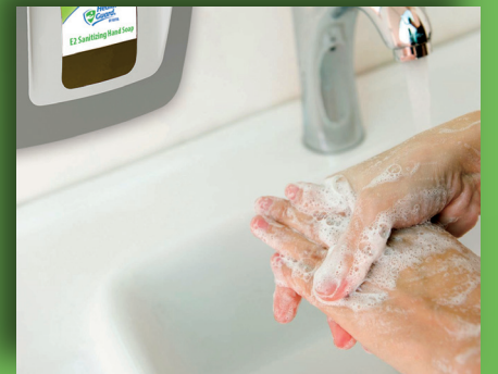
Make hand hygiene a priority in restrooms