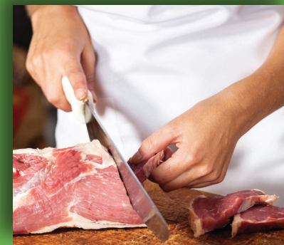
Prepare and serve food with clean hands