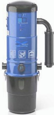
Wall Mounted Garage Vac